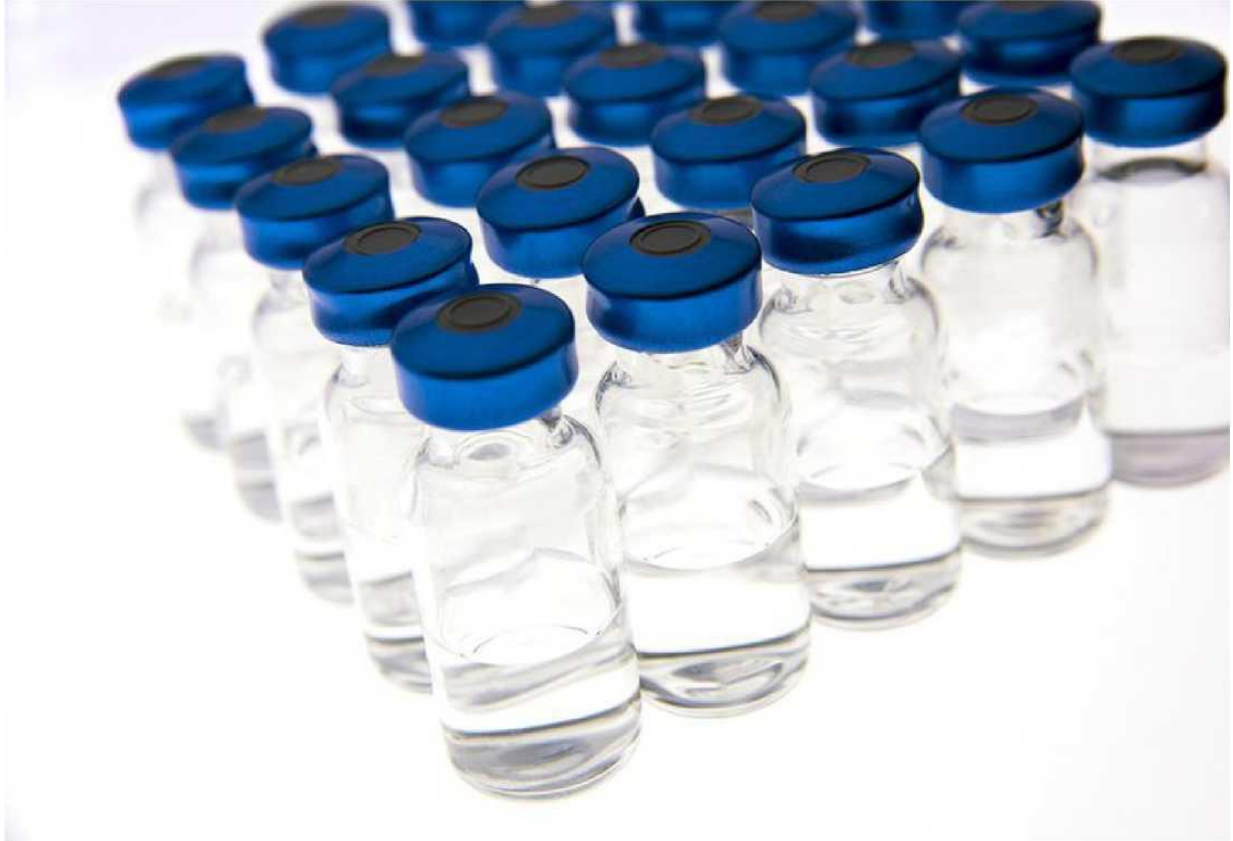
Valor glass vials can withstand impacts and temperature changes.

Corning's most recent noteworthy success is a much smaller object: a vaccine vial made of a new type of glass called "Valor". It was invented at the request of the pharmaceuticals industry, which had been asked by the US health authorities to come up with a material that could better withstand impacts and temperature changes than standard vials. Valor was approved by the Food and Drug Administration in October 2019, three months before COVID-19 was detected.